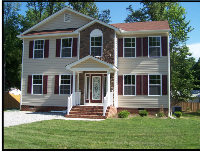
Picture is an example of house style only